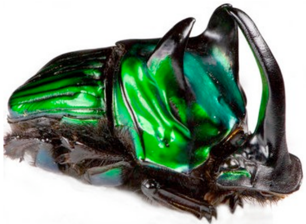
(An Oxysternon conspicillatum, a kind of scarab beetle.)

POSTED BY MARK FRAUENFELDER , MAY 6, 2009 8:29 AM | PERMALINK